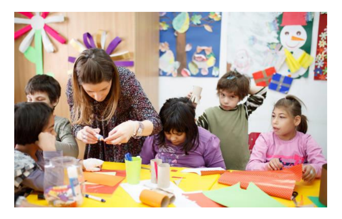
Cheerful School Children with Special needs sitting at a desk in a classroom