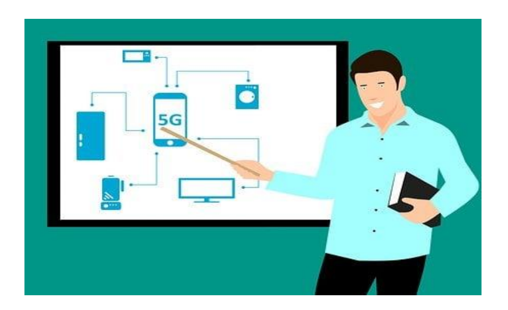
General education teacher standing in front of the class teaching.

These pictures will throw in more light on what the content is all about.